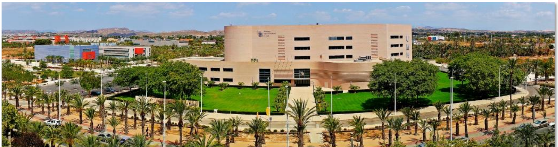
UMH Elche Campus